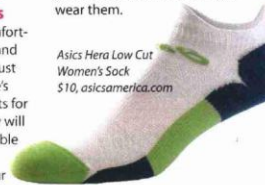
Asics Hera Low Cut Women's Sock $10, asicsamerica.com

Nothing's more annoying that breaking your exercise groove to adjust a sock that won't stay put. Enter the Asics Hera sock. The arch support, mesh air channels and exclusive ankle fit combine to give you a sock that will make you want to keep on going in your workout. Plus, they're low cut, so they'll give you a sleek look wherever you wear them.